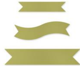
Bitty Banners Big Shot Die Framelits - $25.95