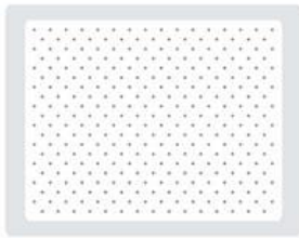
Perfect Polka Dots Textured Impressions Embossing Folder - $13.95