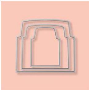
Envelope Liners Framelits Die - $45.95