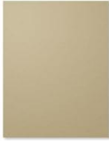
Crumb Cake A4 Card Stock - $11.95