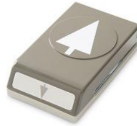
Tree Punch - $29.95