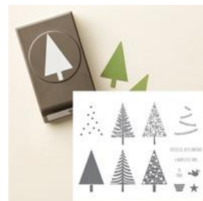
Festival of Trees Photopolymer Bundle - $48.95