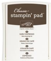
Early Espresso Classic Stampin' Pad - $9.95