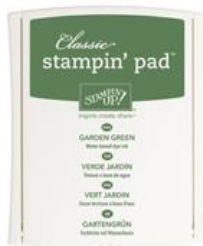
Garden Green Classic Stampin' Pad - $9.95