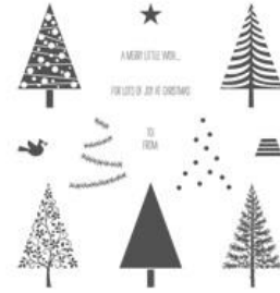
Festival of Trees Photopolymer Stamp set - $27.95