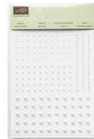
Pearl Basic Jewels Embellishments – 8.95